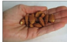
A small handful of nuts is about 1 ounce. For chips and pretzels, 2 handfuls equals about 1 ounce.