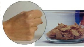
Your fist is about the size of 1 cup or 1 ounce of cereal.

familiarize yourself with portion sizes as they compare to your hand.