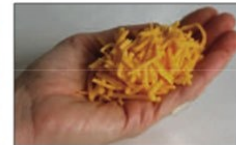
A handful of shredded cheese is about 1 ounce.

Deal quickly with leftovers. If you have unhealthy leftovers in your home, you are likely to indulge. Don't leave them sitting around. Freeze them, give them away or toss them. It's not worth the temptation!